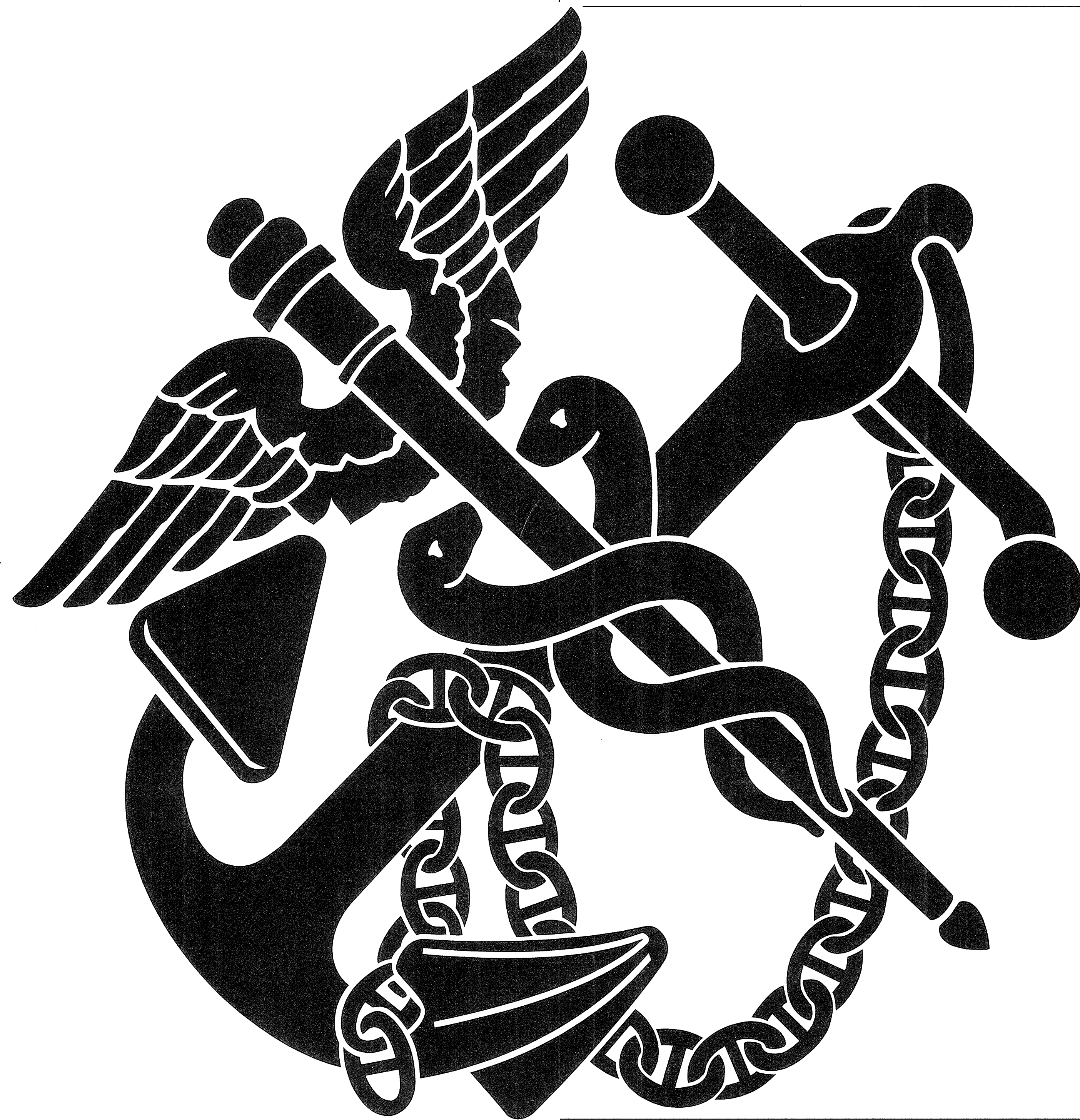
DEVICE 1/2 ACTUAL SIZE FOR 4'-4" X 5'-6" DISTINGUISHING FLAG